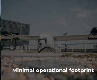
Minimal operational footprint