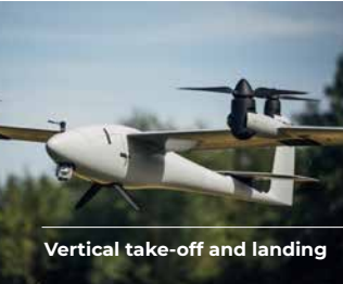
Vertical take-off and landing