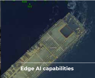
Edge AI capabilities