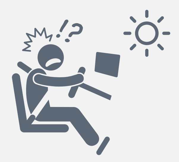
Making the terminal screen readable outdoor

Optical bonding to affix the glass or touch screen to the front of the panel, filling the miniscule air gap between the glass and panel.